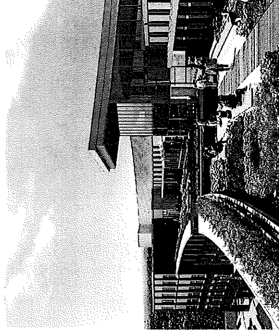
Waltham High School

Ayer-Shirley Bedford Bridgewater-Raynham Chelsea Dennis-Yarmouth Douglas East Longmeadow Grafton Hudson Lexington Lynn Classical Marblehead Mashpee North Middlesex Quincy Somerville Swampscott Tewksbury Memorial Turners Falls Wakefield Waltham Wellesley West Springfield Winchester